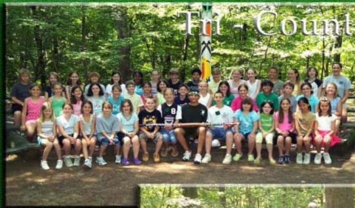
Hi-County 4-H Camp