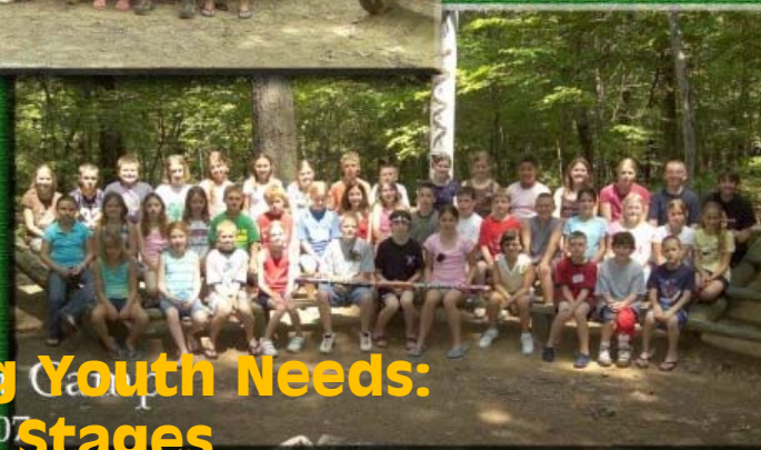
Understanding Youth Needs: Ages & Stages 2007